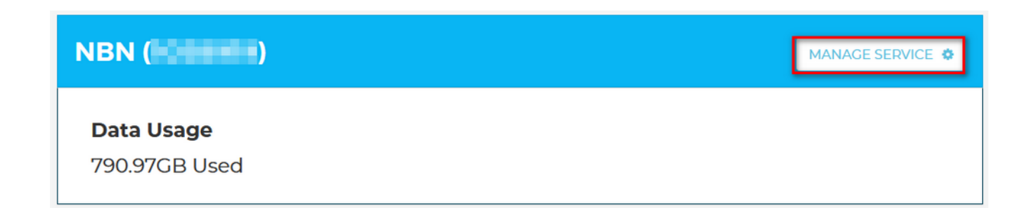
Step 4: Locate the AVC ID. Your AVC ID will be displayed on the service details page.