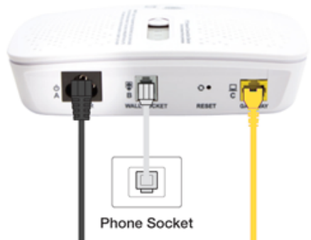
NBN Connection Device